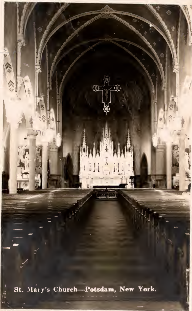
St. Mary's Church—Potsdam, New York.